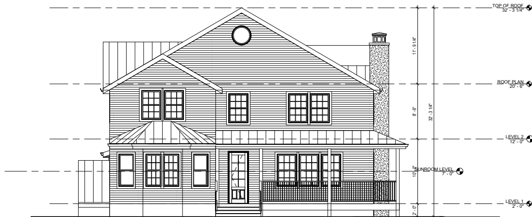
② PROPOSED FRONT ELEVATION 1/4" = 1'-0"

QIRIAZ FLORENTINA SINGLE FAMILY PROJECT TOPSFIELD MA