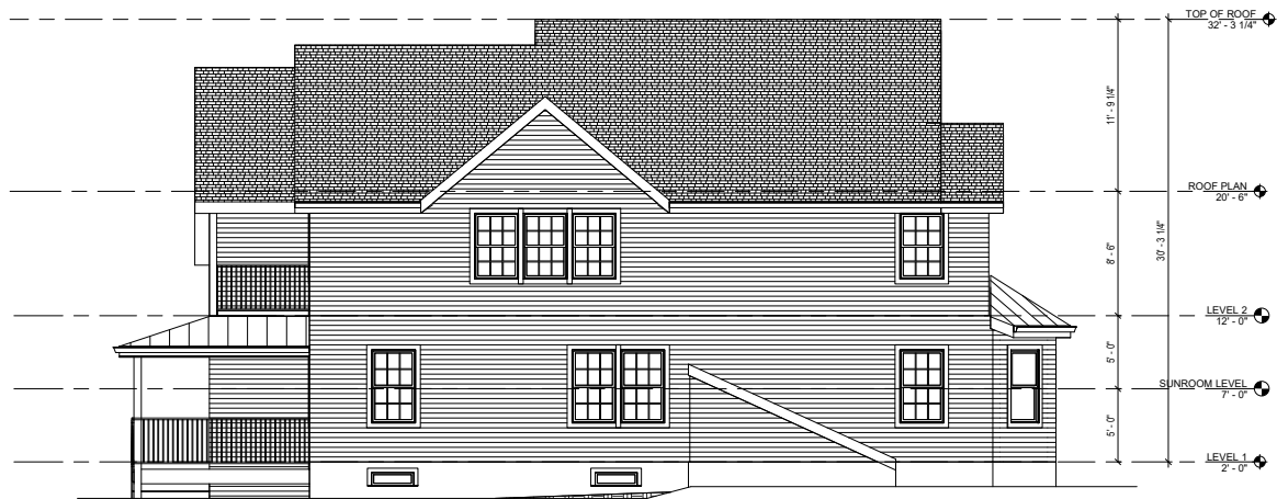
① PROPOSED LEFT EXTERIOR ELEVATION 1/4" = 1'-0"