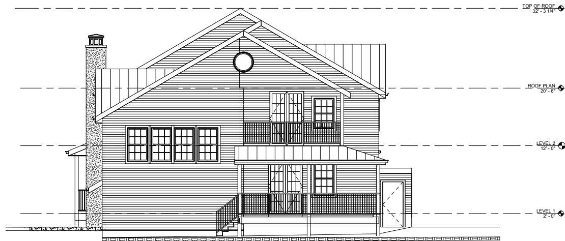
② PROPOSED REAR EXTERIOR ELEVATION 1/4" = 1'-0"

QIRUAZ FLORENTINA SINGLE FAMILY PROJECT TOPSFIELD MA