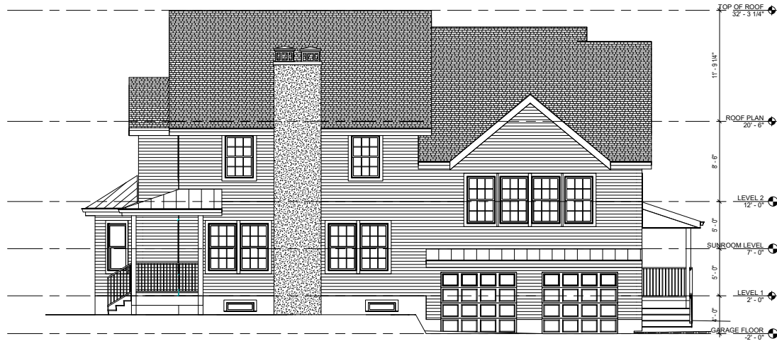
① PROPOSED EXTERIOR RIGHT ELEVATION 1/4" = 1'-0"