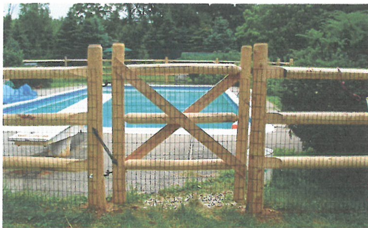
Sample of gate style but our rails would be diamond not round as seen above. See additional pictures with application.

Approx. 520' of 4' black 1" x 1" wire mesh attached to fence and gates